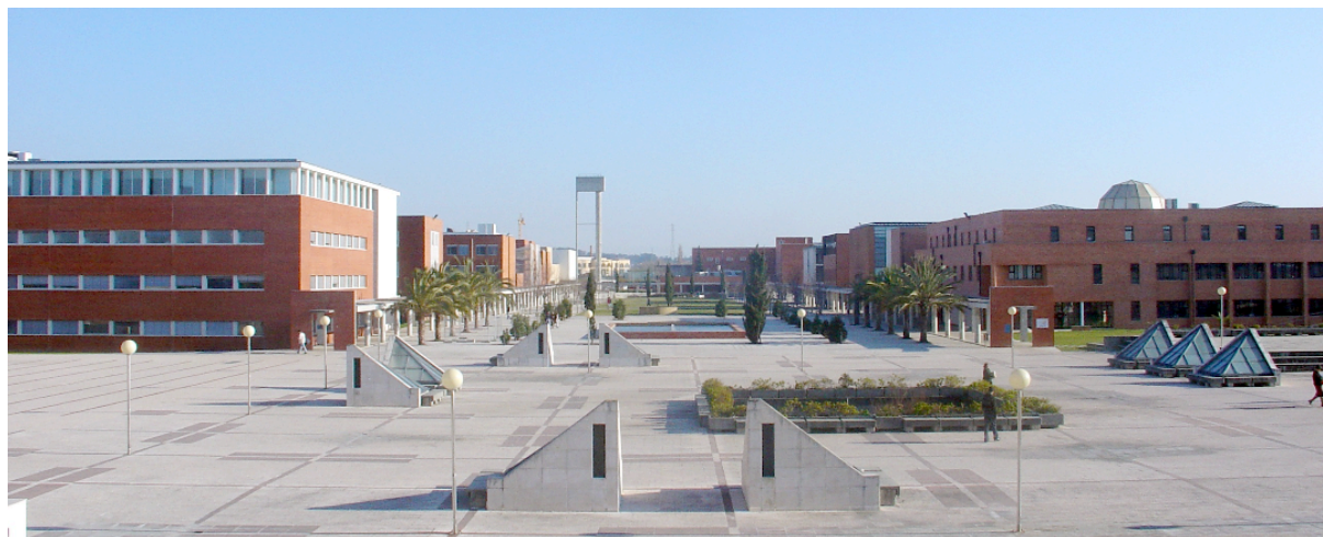
University of Aveiro, Portugal